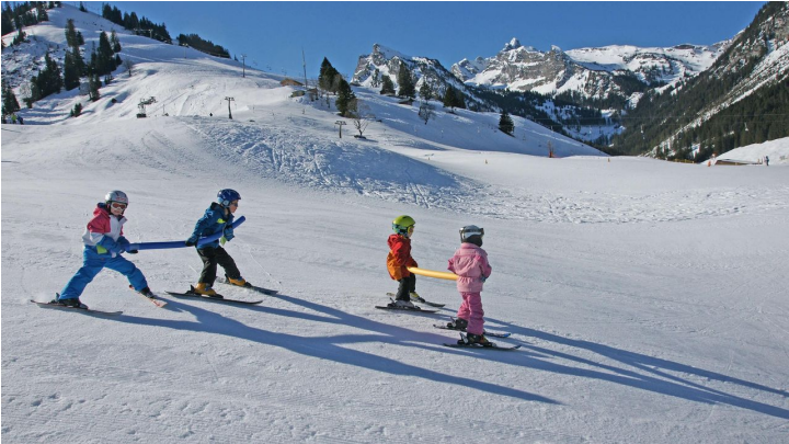
Naturpark Diemtigtal