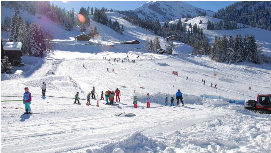
Skischule Diemtigtal, Interlaken Tourismus - web@interlaketourism.ch