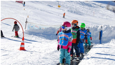
Naturpark Diemtigtal