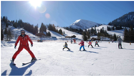
Naturpark Diemtigtal