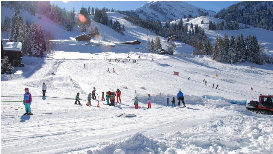
Skischule Diemtigtal, Interlaken Tourismus - web@interlakentourism.ch