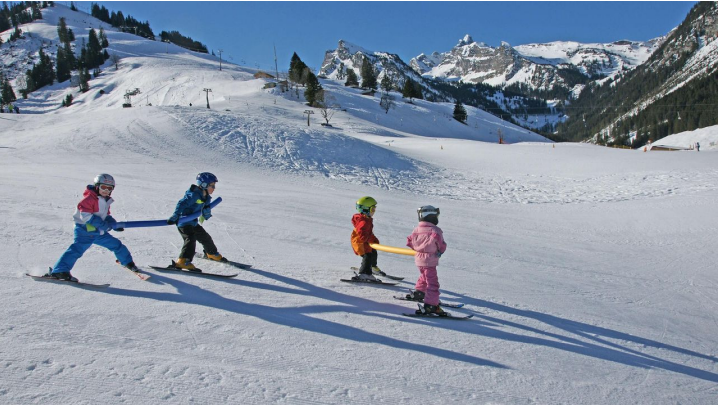
Naturpark Diemtigtal