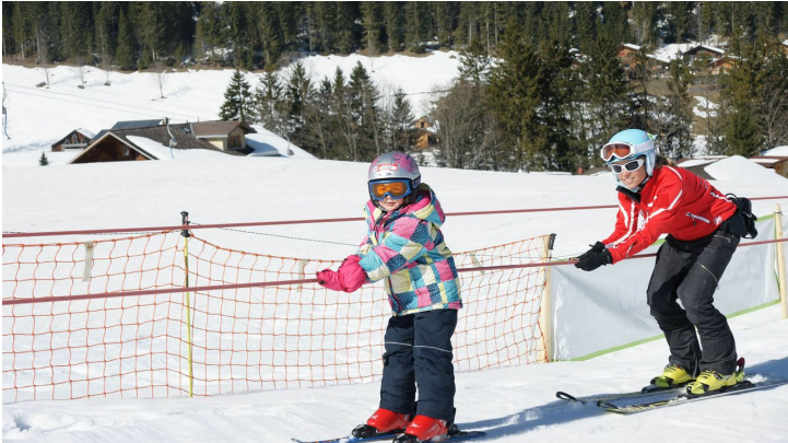
Naturpark Diemtigtal, Interlaken Tourismus - web@interlaktourismus.ch