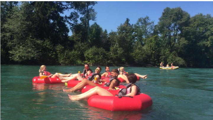
Aareschlauchboot GmbH, Interlaken Tourismus - web@interlaketourism.ch