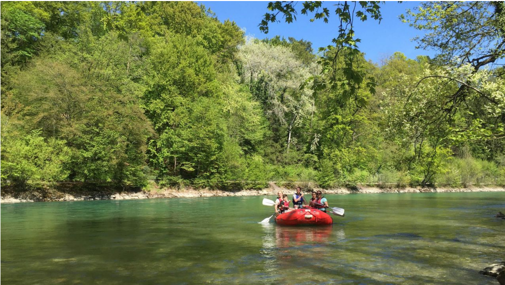
Aareschlauchboot GmbH, Interlaken Tourismus - web@interlaketourism.ch