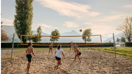
Neuhaus Strandbad