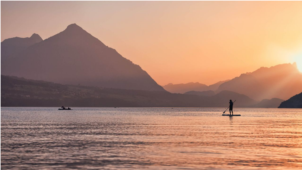
Neuhaus Strandbad