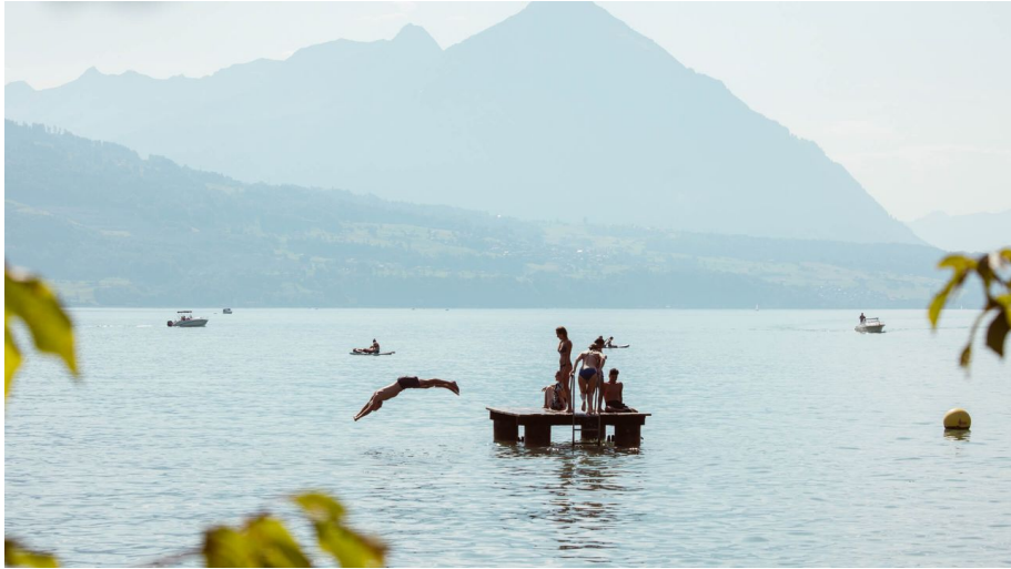
Neuhaus Strandbad