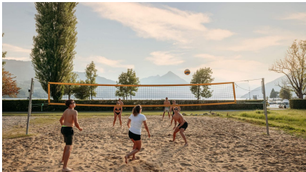
Neuhaus Strandbad