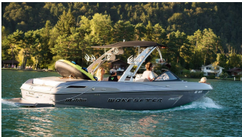
Neuhaus Strandbad