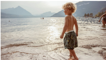
Neuhaus Strandbad