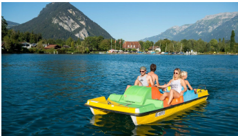
Neuhaus Strandbad