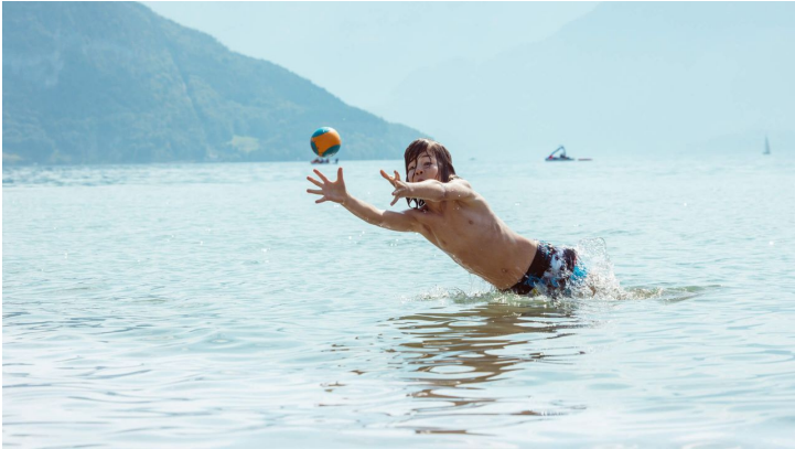
Neuhaus Strandbad