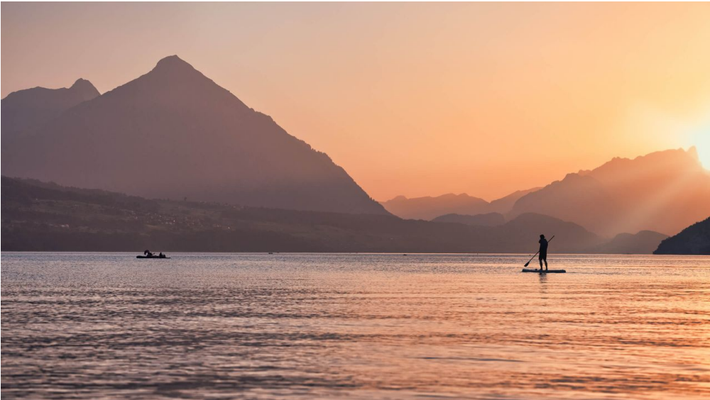
Neuhaus Strandbad