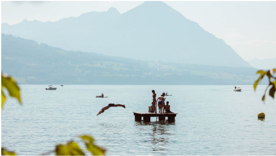
Neuhaus Strandbad