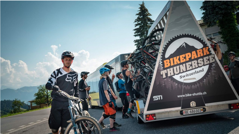
Bikepark Thunersee

The shuttle runs on Saturday & Sunday 10.15 – 16.15 h. Only with snow-free and dry conditions, decisive at least two hours before execution.