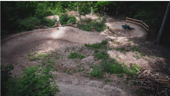
Bikepark Thunersee, Interlaken Tourismus - web@interlaketourism.ch