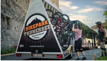
Bikepark Thunersee