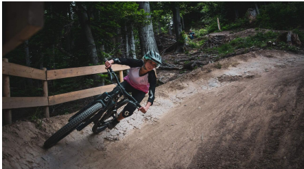
Bikepark Thunersee