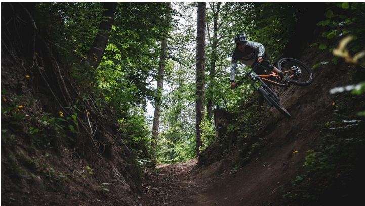
Bikepark Thunersee, Interlaken Tourismus - web@interlaketourism.ch