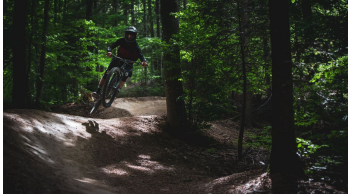
Bikepark Thunersee, Interlaken Tourismus - web@interlaketourism.ch