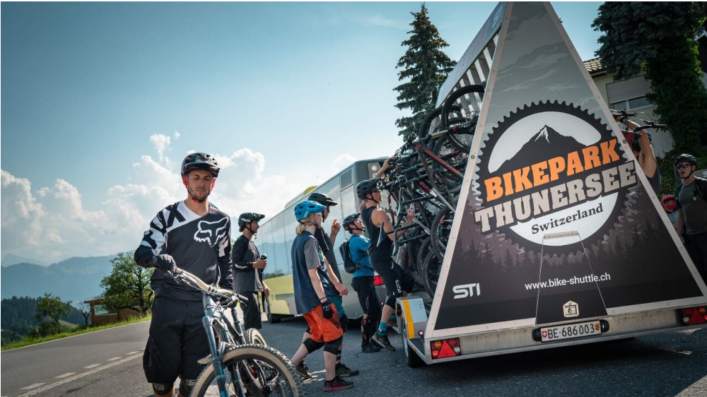
Bikepark Thunersee

The shuttle runs on Saturday & Sunday 10.15 – 16.15 h. Only with snow-free and dry conditions, decisive at least two hours before execution.