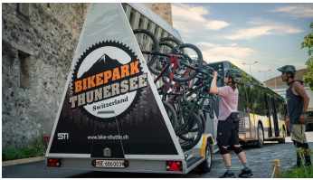
Bikepark Thunersee, Interlaken Tourismus - web@interlaketourism.ch