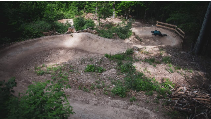
Bikepark Thunersee