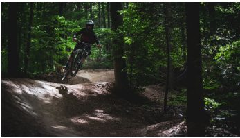
Bikepark Thunersee, Interlaken Tourismus - web@interlaketourism.ch