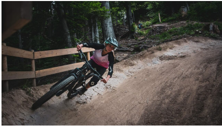
Bikepark Thunersee