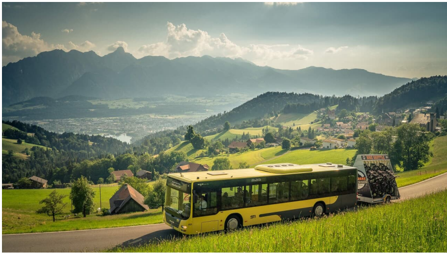
STI Services AG, Interlaken Tourismus - web@interlaktourismus.ch

vélo / bike / Scooter bus stops bus company summer