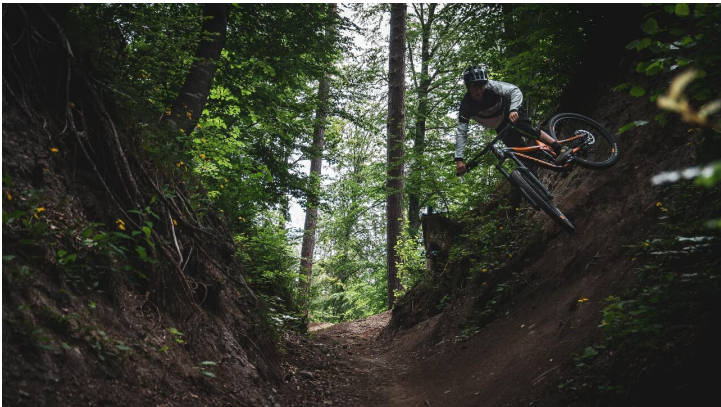
Bikepark Thunersee, Interlaken Tourismus - web@interlaketourism.ch