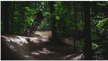
Bikepark Thunersee, Interlaken Tourismus - web@interlaketourism.ch