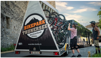
Bikepark Thunersee, Interlaken Tourismus - web@interlaketourism.ch