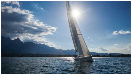
Segelschule Thunersee, Interlaken Tourismus - web@interlaktourism.ch