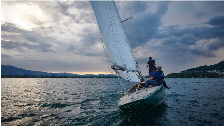
Segelschule Thunersee, Interlaken Tourismus - web@interlaketourism.ch