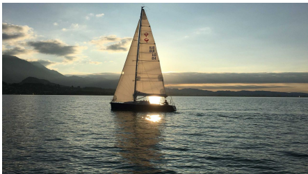
Segelschule Thunersee