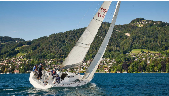
Segelschule Thunersee, Interlaken Tourismus - web@interlaktourism.ch