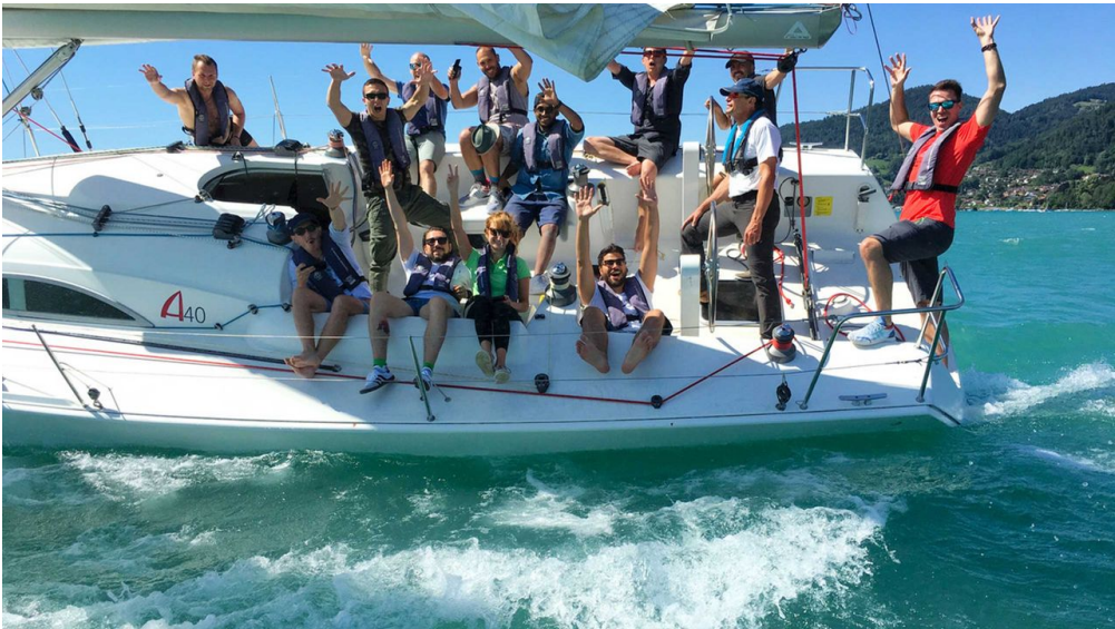
Segelschule Thunersee