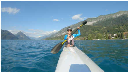
Surfskipoint, Interlaken Tourismus - web@interlaketourism.ch