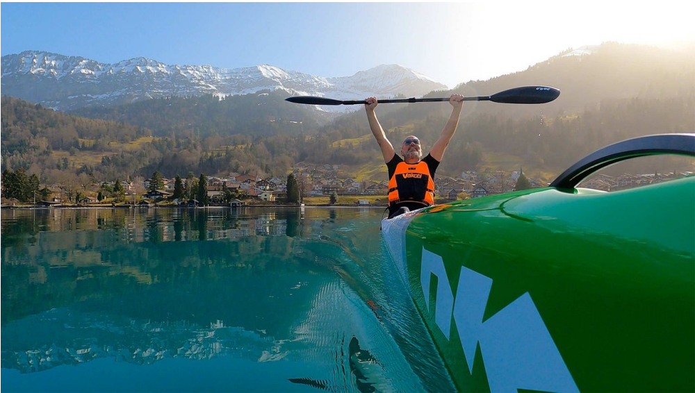
Surfskipoint, Interlaken Tourismus - web@interlaketourism.ch