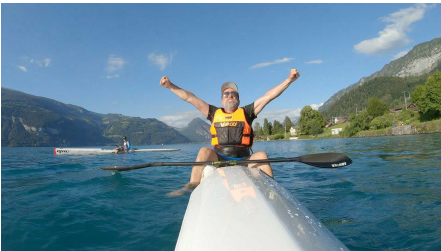
Surfskipoint