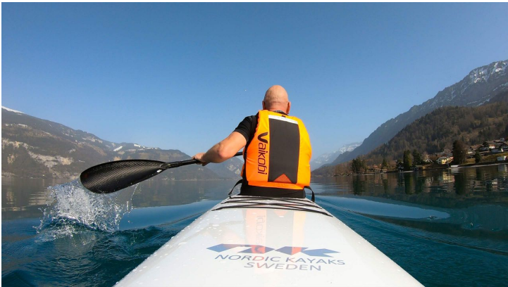
Surfskipoint Gunten, Interlaken Tourismus - web@interlaketourism.ch