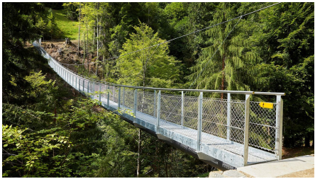
Interlaken Tourismus - web@interlaktourism.ch