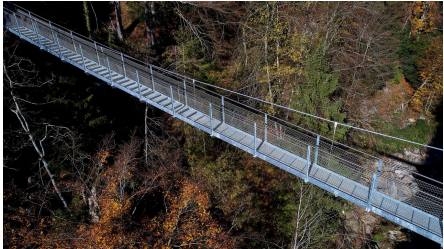
Interlaken Tourismus, Verein Panorama Rundweg Thunersee - web@interlaktourism.ch