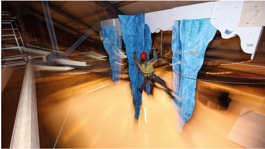
Outdoor Switzerland AG, Interlaken Tourismus - web@interlaktourismus.ch