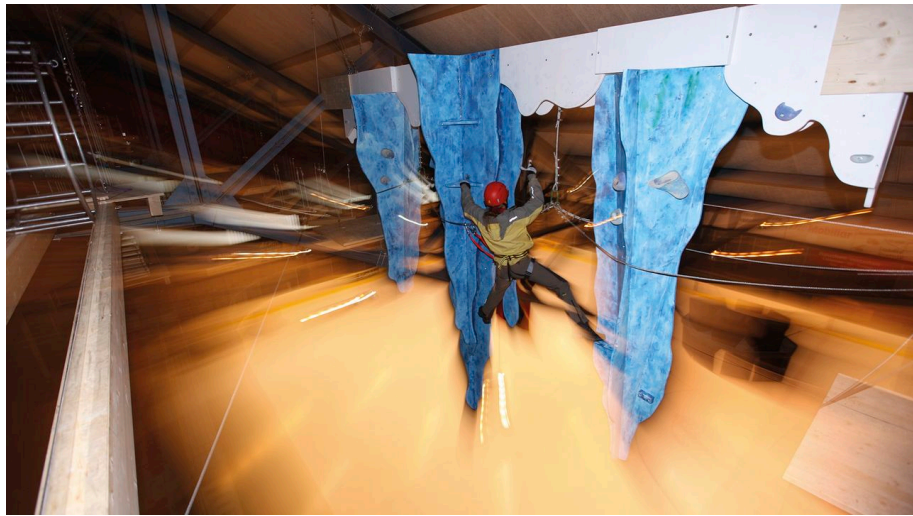
Outdoor Switzerland AG, Interlaken Tourismus - web@interlaktourismus.ch