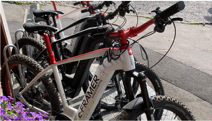
Beatenberg Tourismus, Interlaken Tourismus - web@interlaktourism.ch

Open like Beatenberg Tourist Information Centre Renting from April to November