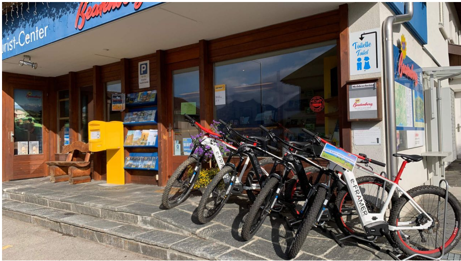
Beatenberg Tourismus, Interlaken Tourismus - web@interlaketourism.ch

fitness | vélo / bike / Scooter | bike rental / repair | e bike rental station