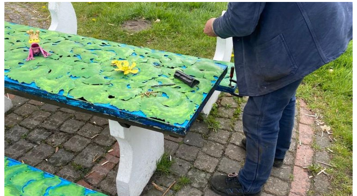
Aufbau der Schilfbank