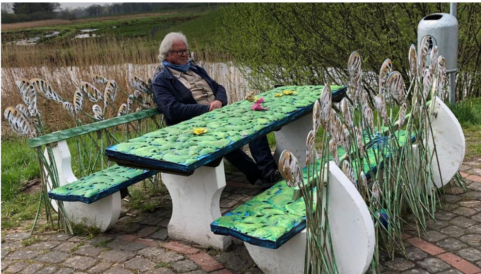
Lieblingsort Alte Staaßenbrücke-Schilfbank