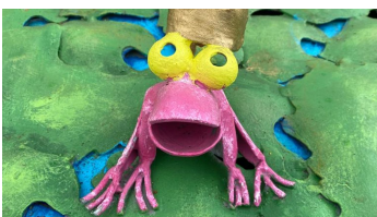
Frosch im Lieblingsort