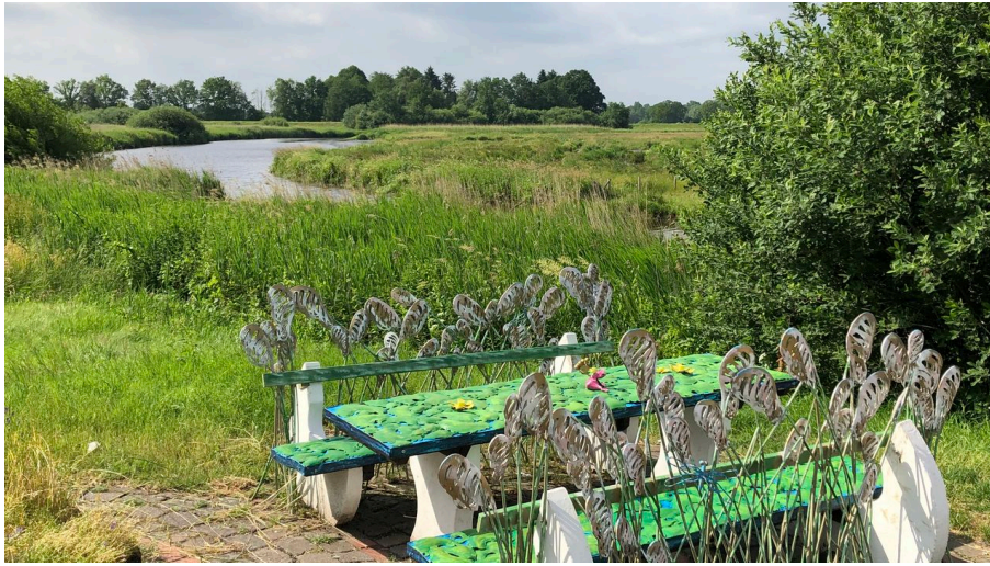
Lieblingsort Alte Staaßenbrücke