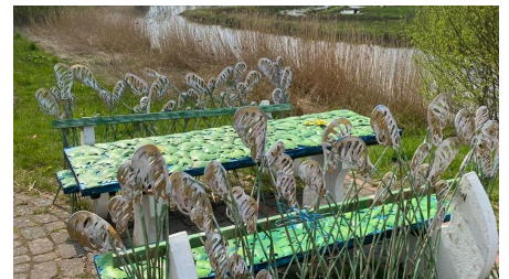
Lieblingsort alte Staaßen Brücke