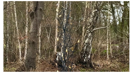
Stele an der Plaggenhütte