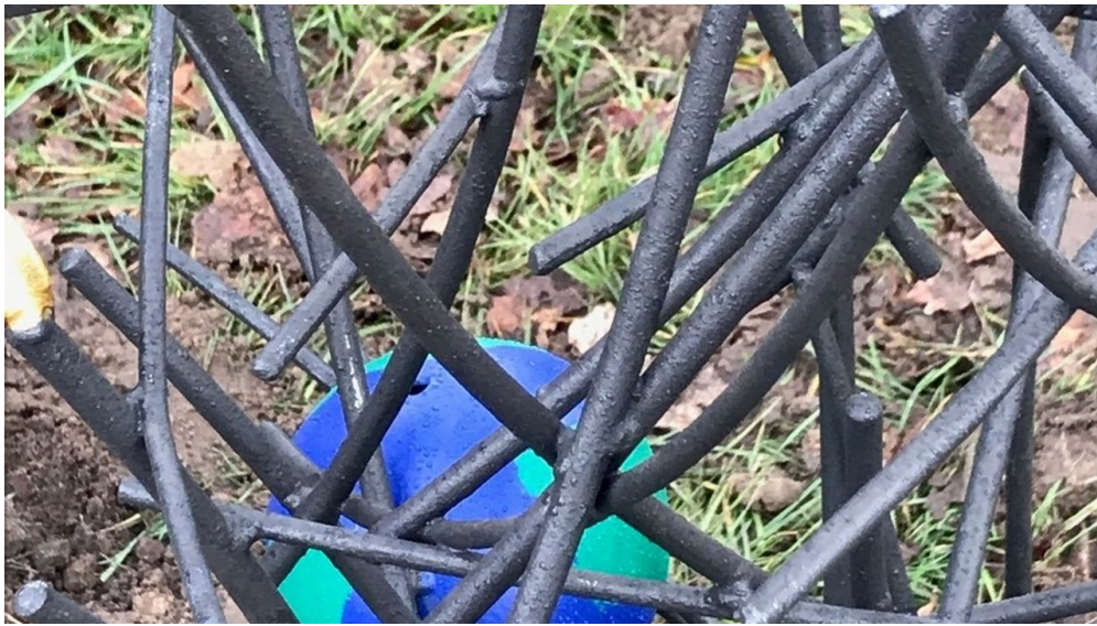
Weltkugel in der Stele