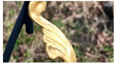
Goldene Blätter in der Stele