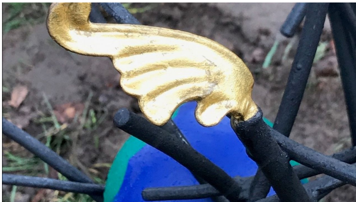
Goldenes Blatt und Weltkugel in der Stele