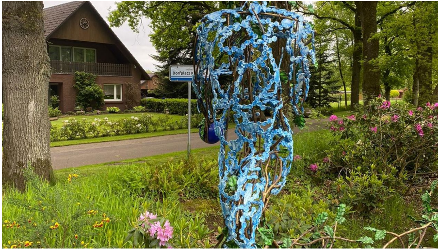
Lieblingsort Klahörn - Eichenkönig