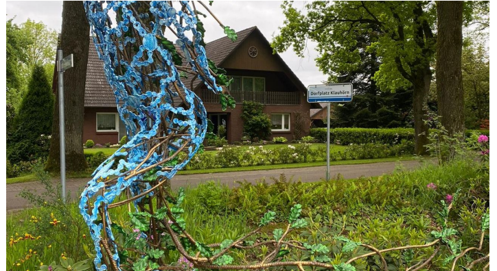
Eichenkönig mit Bank