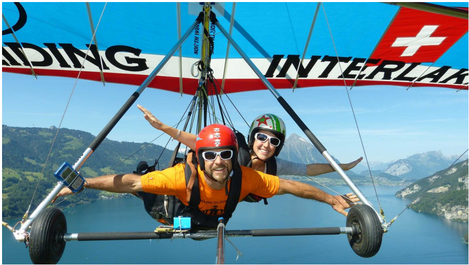
Hang Gliding Interlaken