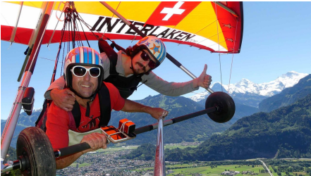
Hang Gliding Interlaken, Interlaken Tourismus - web@interlaketourism.ch