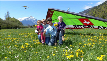
Hang Gliding Interlaken