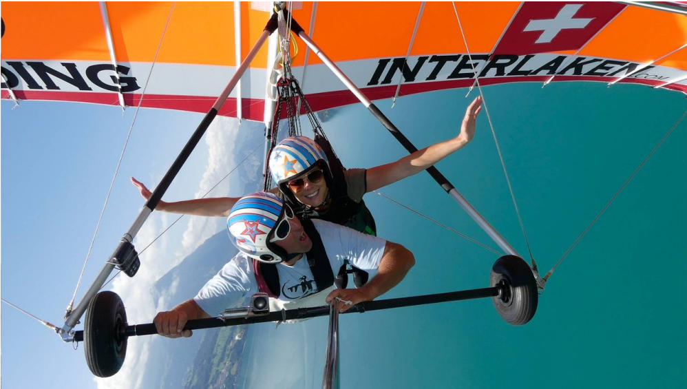
Hang Gliding Interlaken