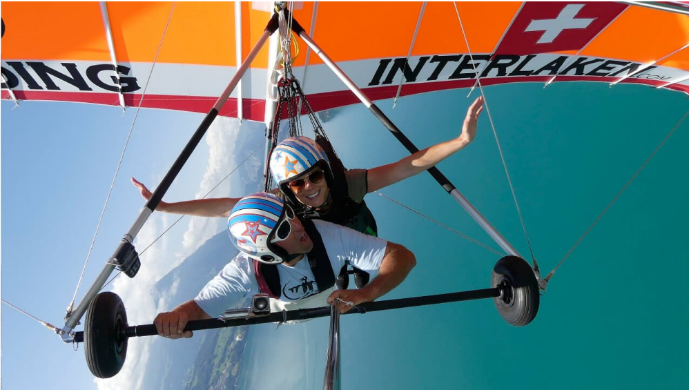
Hang Gliding Interlaken, Interlaken Tourismus - web@interlaketourism.ch