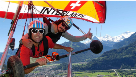
Hang Gliding Interlaken, Interlaken Tourismus - web@interlaketourism.ch