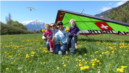
Hang Gliding Interlaken, Interlaken Tourismus - web@interlaketourism.ch