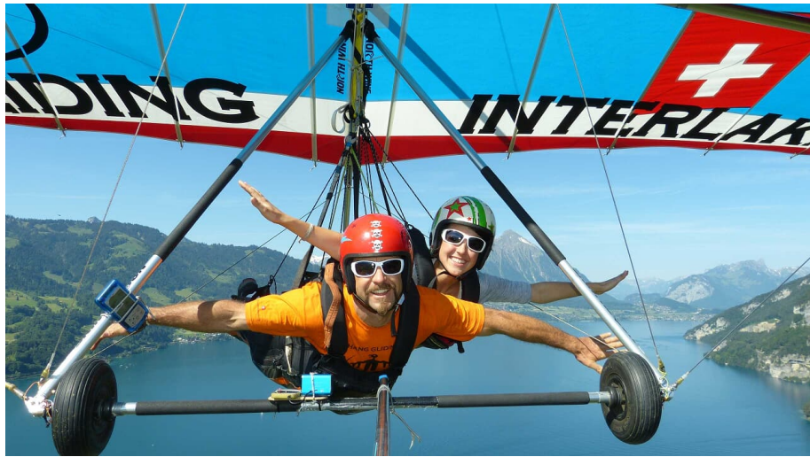
Hang Gliding Interlaken