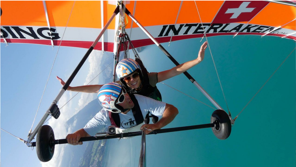
Hang Gliding Interlaken