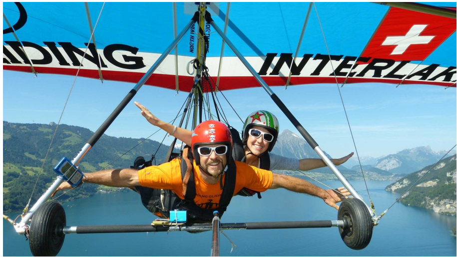
Hang Gliding Interlaken