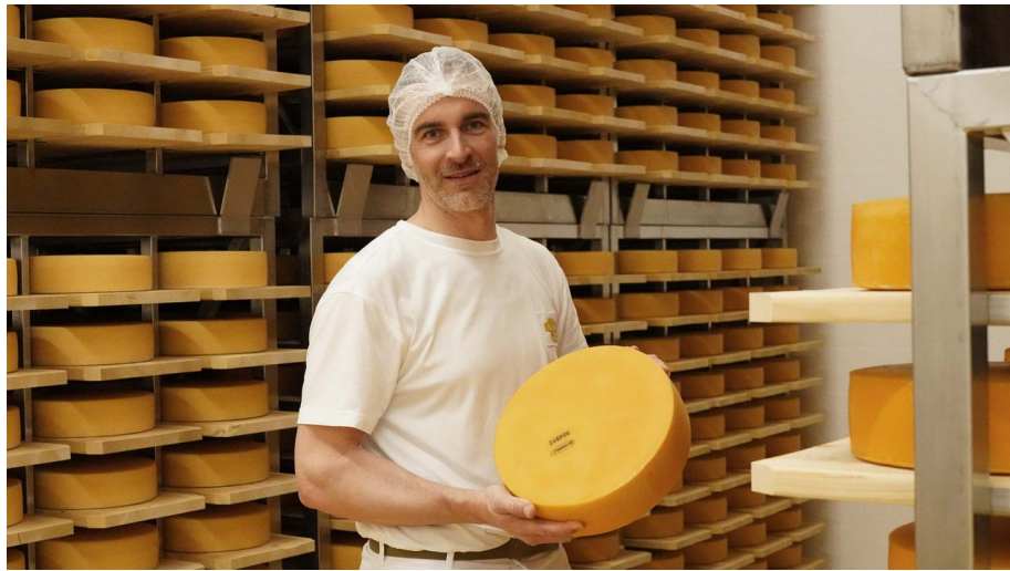
Simmental Switzerland AG, In - web@interlaketourism.ch

attractions craft farm shop/direct sales