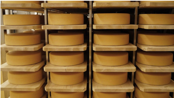
Simmental Switzerland AG, Interlaken Tourismus - web@interlaketourism.ch