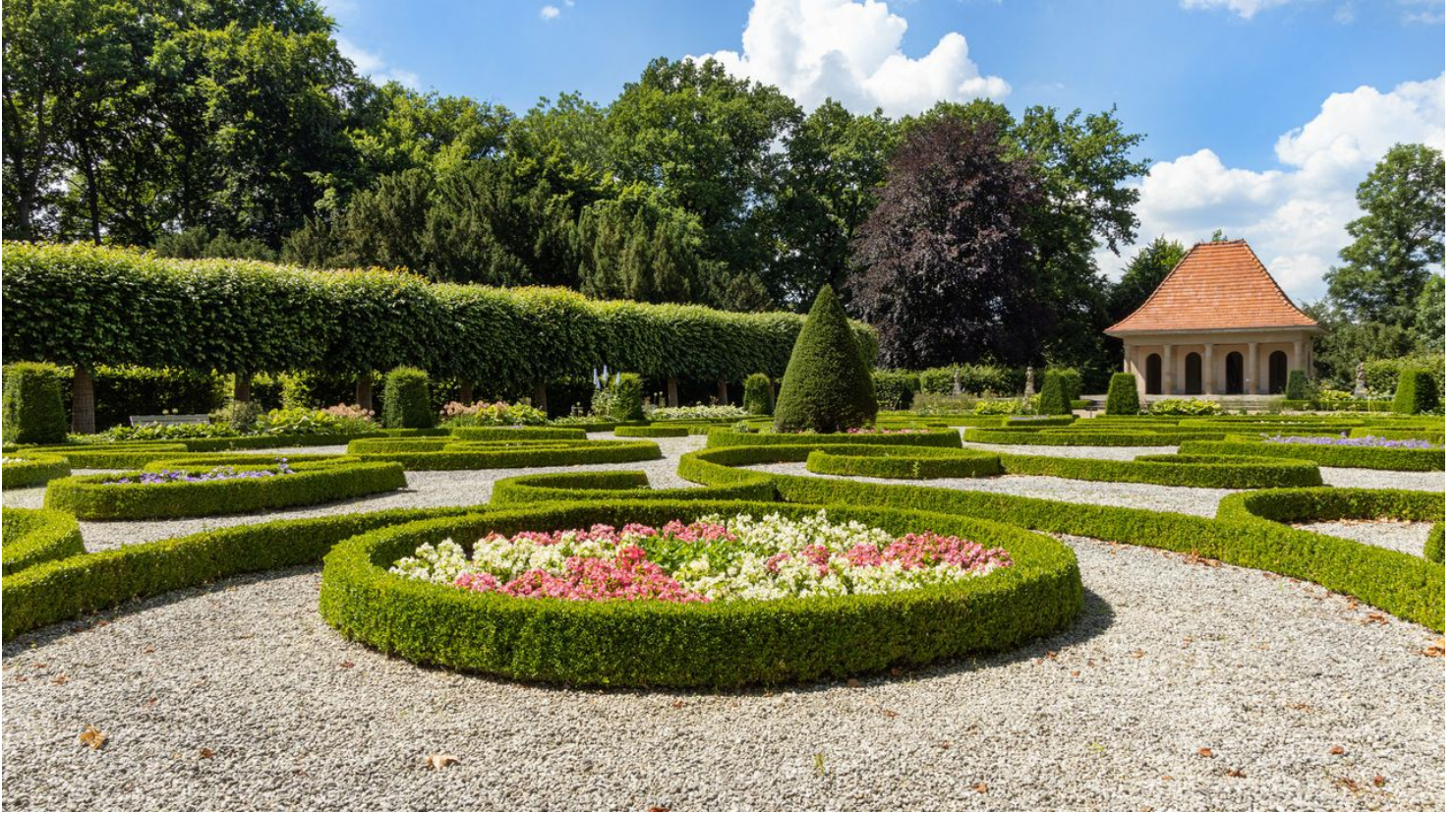
WMG Wolfsburg