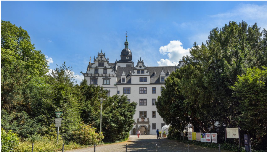
WMG Wolfsburg

Other architecture, infrastructure, culture destinations