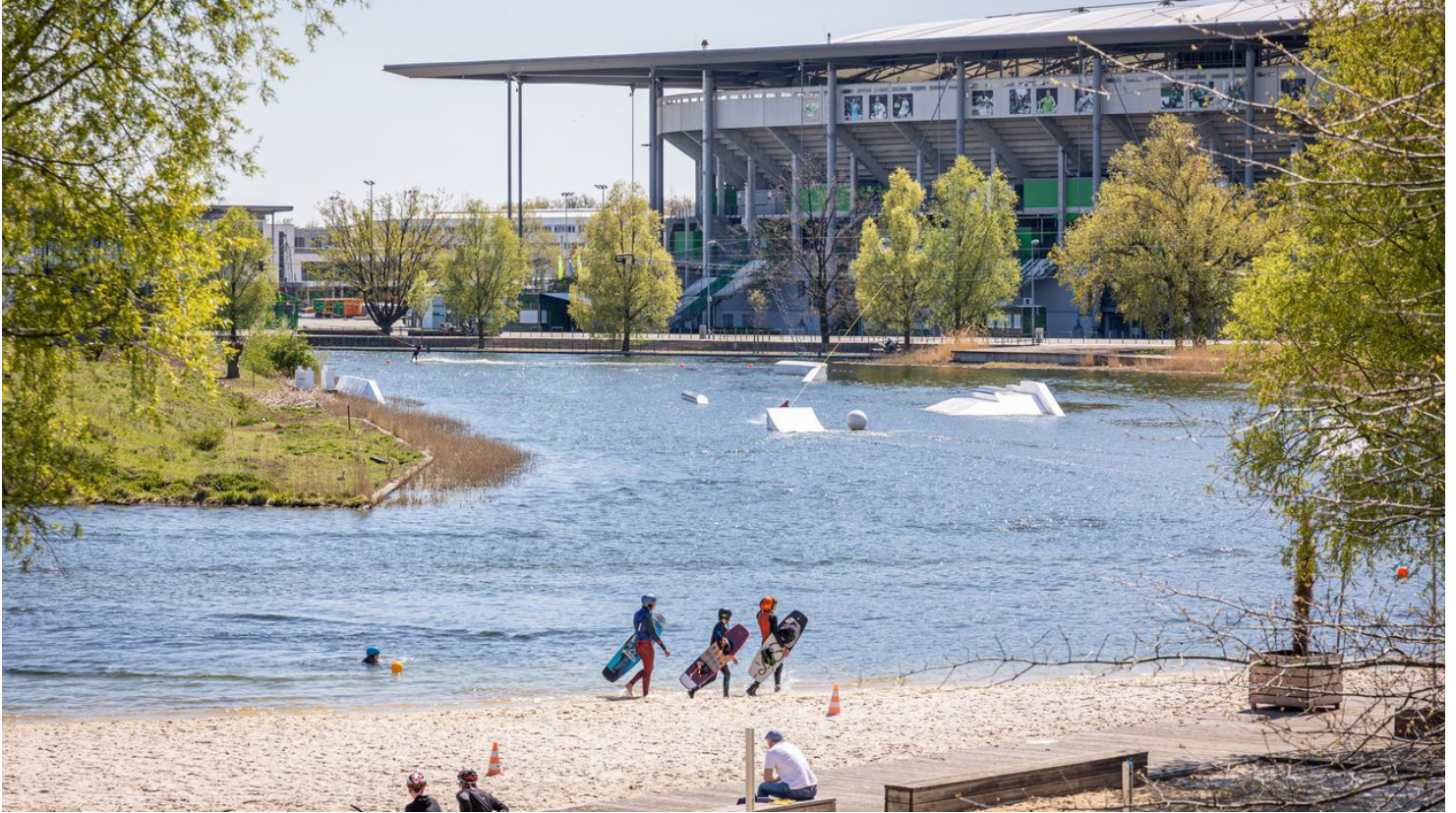
WMG Wolfsburg