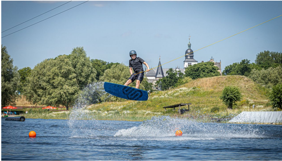
WMG Wolfsburg