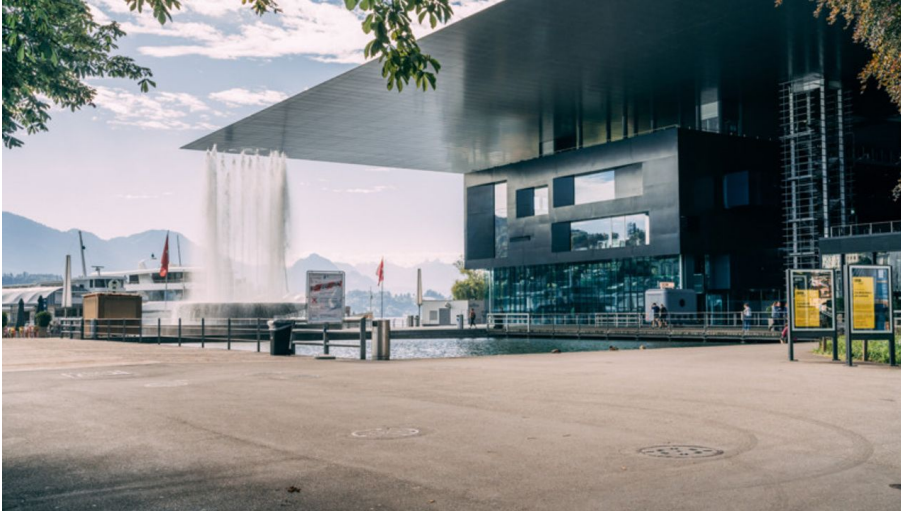
KKL Luzern