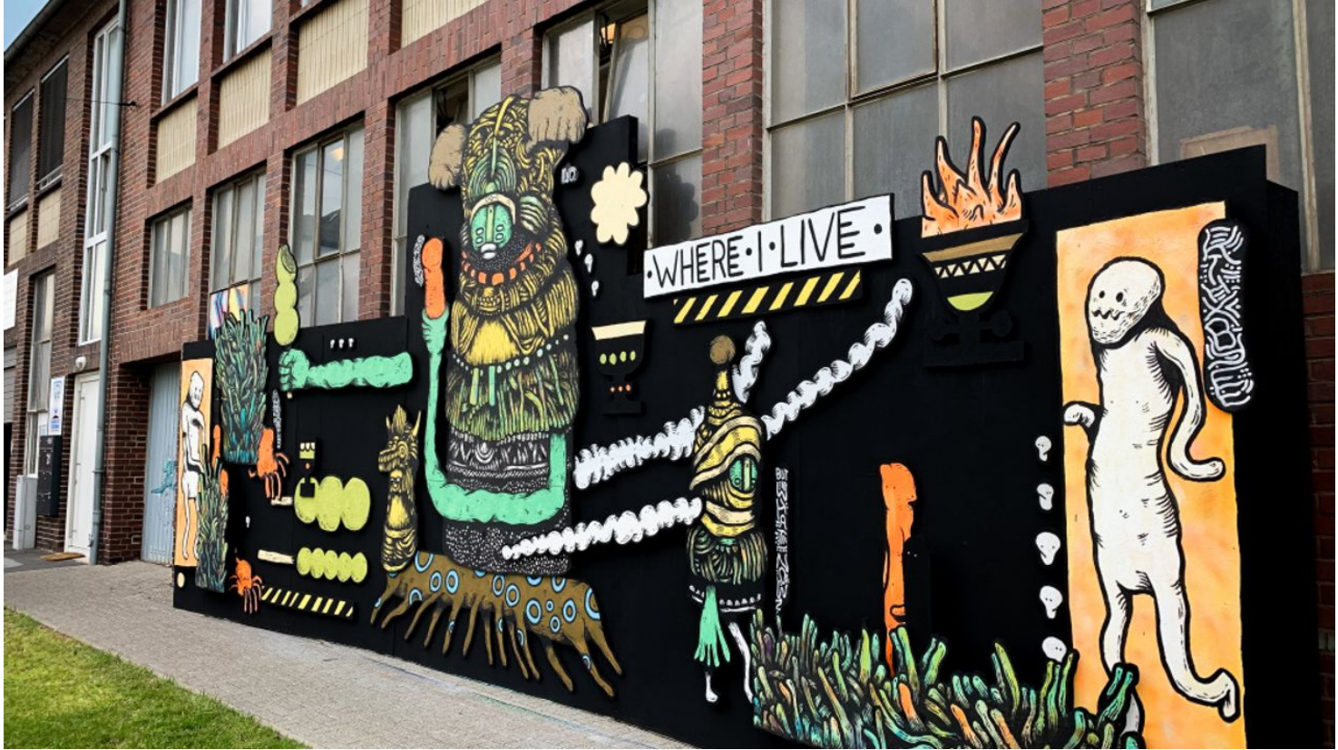
Kassel Marketing GmbH