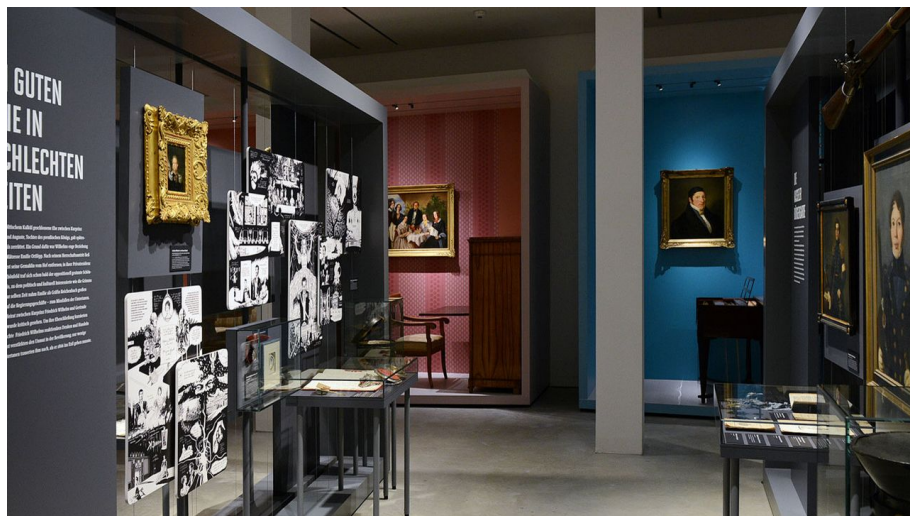
Stadt Kassel