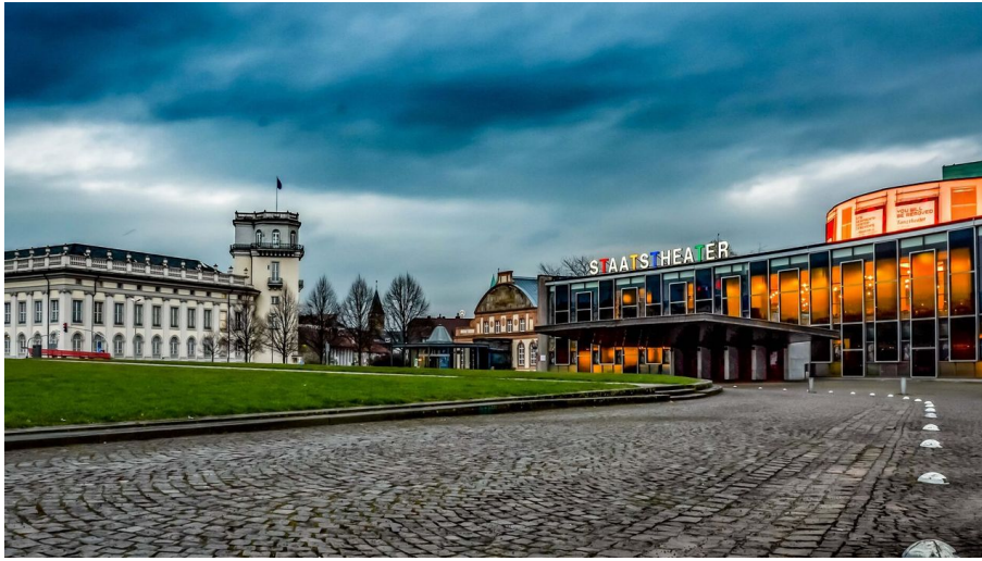
Stadt Kassel