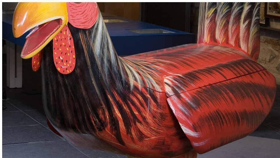
Stadt Kassel; Foto: Museum für Sepulchralkultur