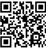
Fondue Cooking Class