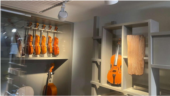
Geigenbauschule Brienz, Interlaken Tourismus - mail@interlaktourismus.ch