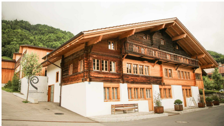
Geigenbauschule Brienz, Interlaken Tourismus - mail@interlaktourismus.ch