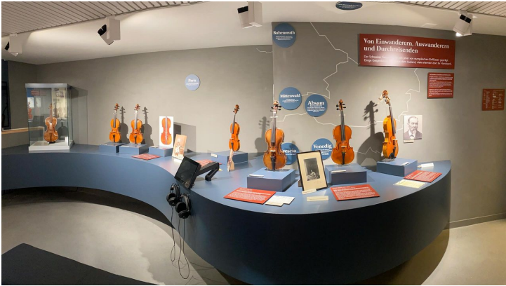
Geigenbauschule Brienz, Interlaken Tourismus - mail@interlaktourismus.ch