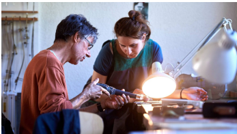
Geigenbauschule Brienz, Interlaken Tourismus - mail@interlaktourismus.ch