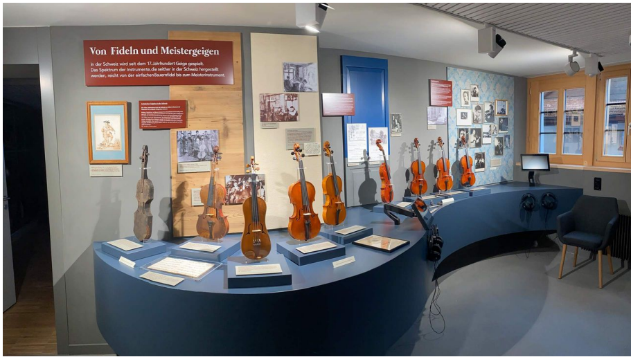
Geigenbauschule Brienz

museums craft historic buildings attractions summer winter