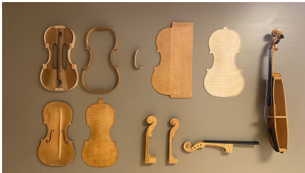
Geigenbauschule Brienz