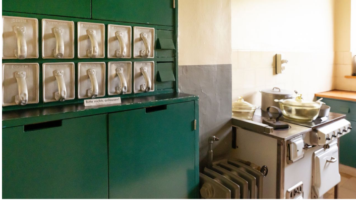
Frankfurt_Ernst-May-Haus_1040824_© #visitfrankfurt_plazy_Isabela_Pacini.jpg - © #visitfrankfurt_plazy_Isabela_Pacini Frankfurt_Ernst-May-Haus_1040829_© #visitfrankfurt_plazy_Isabela_Pacini.jpg - © #visitfrankfurt_plazy_Isabela_Pacini