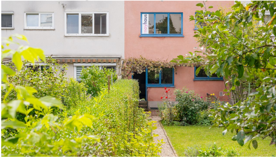
Frankfurt_Ernst-May-Haus_1040815_© #visitfrankfurt_plazy_Isabela_Pacini.jpg - © #visitfrankfurt_Isabela_Pacini