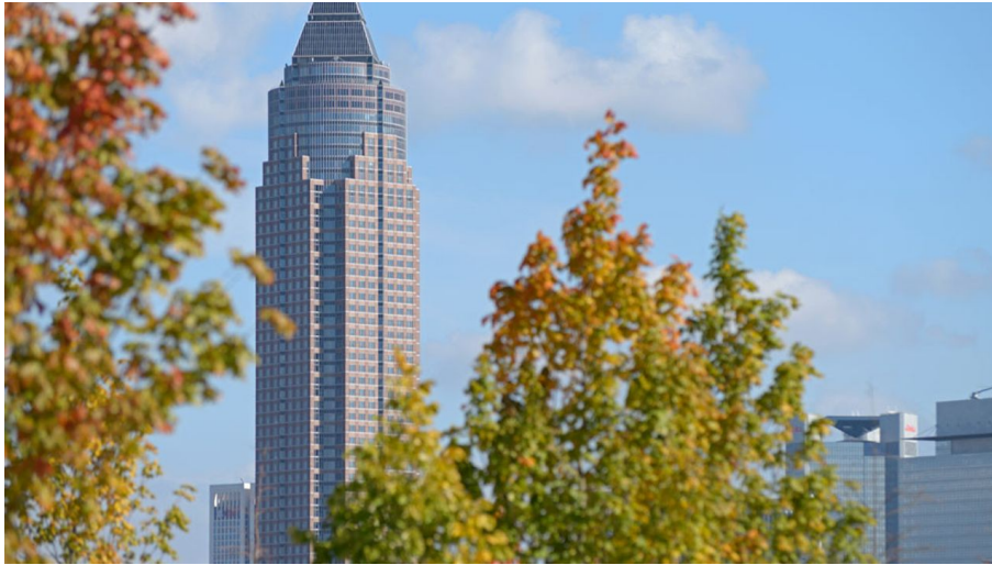
Messturm - © #visitfrankfurt

The tower is one of Frankfurt's city landmarks and a symbol of the economic boom.