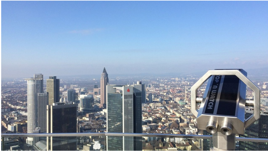
MAIN TOWER Aussicht visitfrankfurt Petra Winter IMG 3483