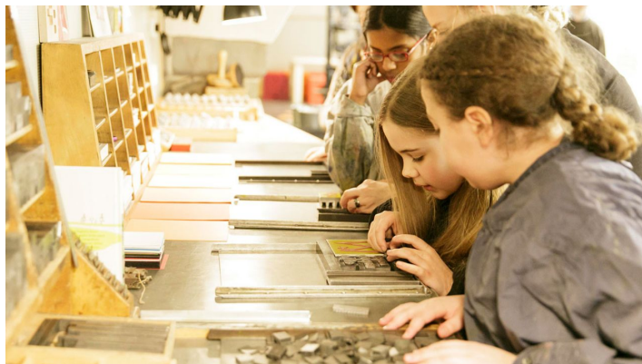
Junges Museum Frankfurt Druckwerkstatt

Geschlossen: 24.12.2024 - 24.12.2024 Christmas Eve Geschlossen: 01.01.2024 Christmas Geschlossen: 25.12.2023