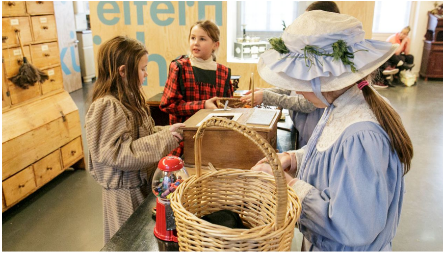
Junges Museum Frankfurt Kolonialwarenladen