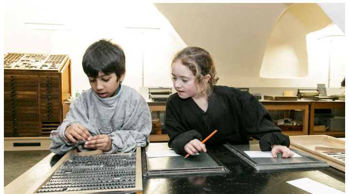
Junges Museum Frankfurt Druckwerkstatt