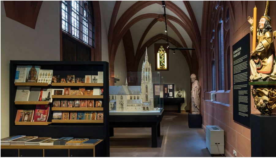
Dommuseum Innenansicht