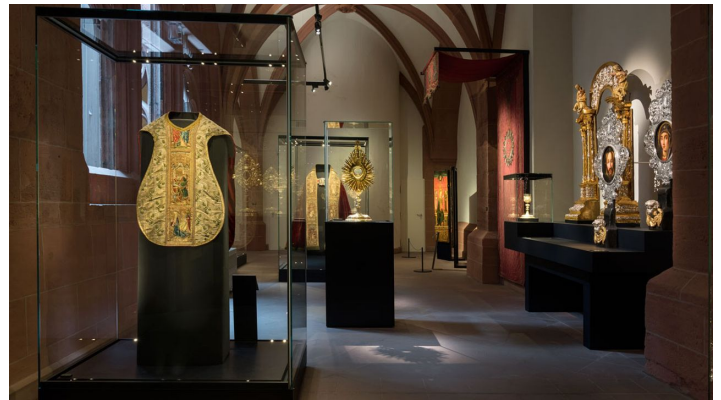
Domuseum Innenansicht 2