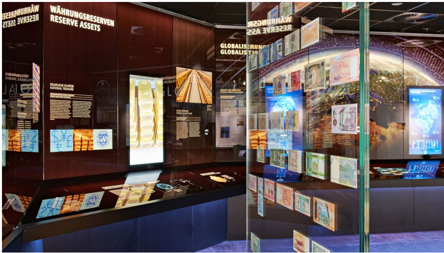
Geldmuseum Geld global