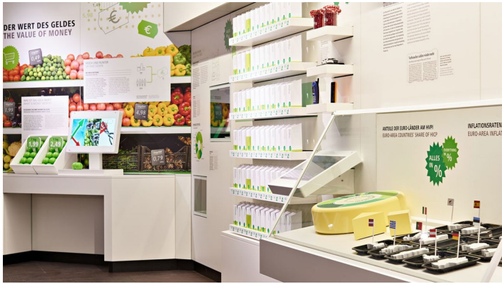
Geldmuseum Geldpolitik