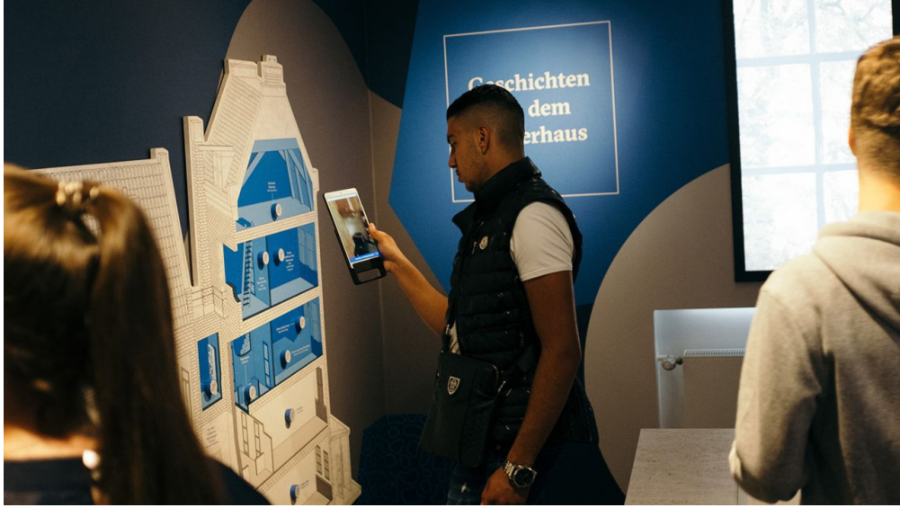
Bildungsstätte Anne Frank e.V. Hinterhaus