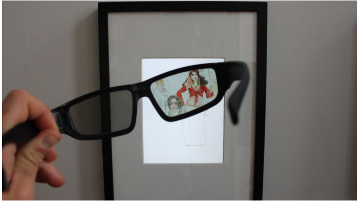
Bildungsstätte Anne Frank e.V. Racist Glasses