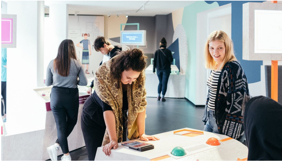
Bildungsstätte Anne Frank e.V. Workshop Lernlabor