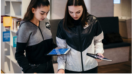
Bildungsstätte Anne Frank e.V. Lernlabor