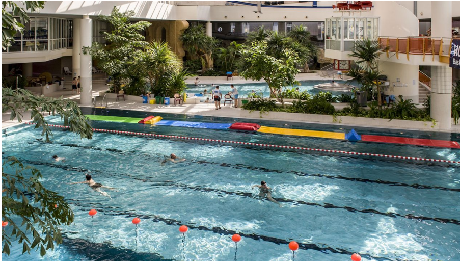
Erlebnisbad Titus Thermen