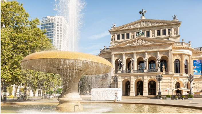
Frankfurt_Alte Oper_1040020_©#visitfrankfurt_Isabela_Pacini.jpg