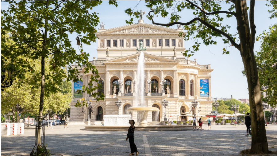
Frankfurt_Alte Oper_1040007_©#visitfrankfurt_Isabela_Pacini.jpg - © #visitfrankfurt_plazy_Isabela_Pacini