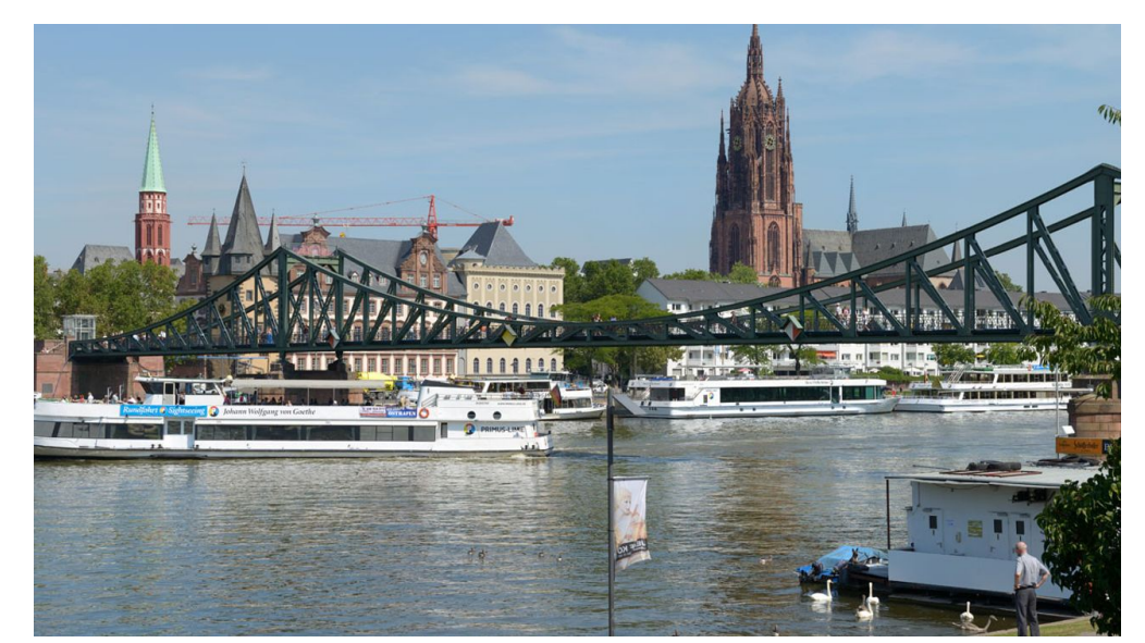
Dom Main Eiserner Steg - {\mathbin{\mathbb Q}} #visitfrankfurt