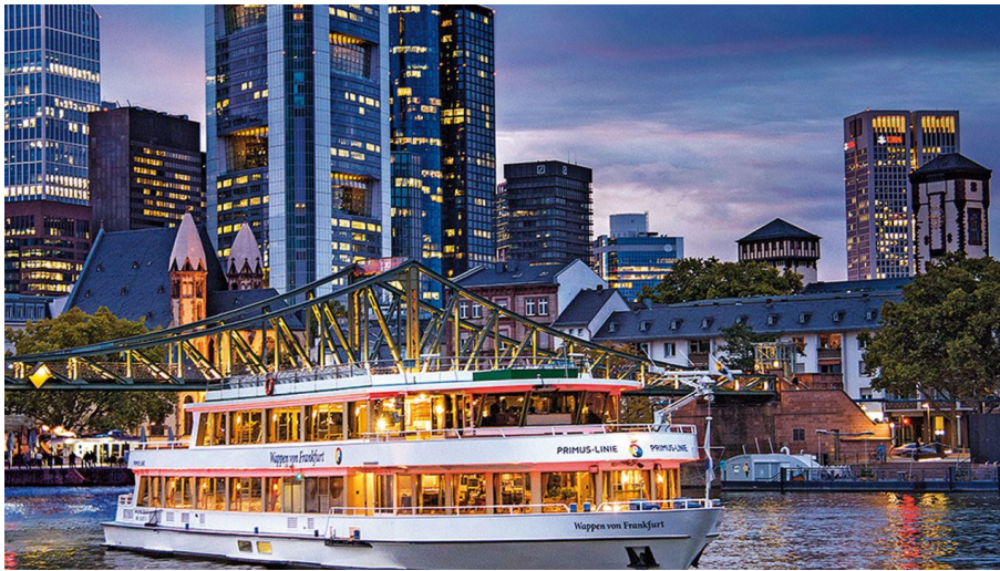
Primus-Linie Schifffahrt Wappen von Frankfurt Skyline