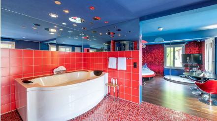
Hotel Zeit & Traum, Interlaken Tourismus - web@interlaketourismus.ch