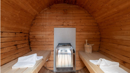
Hotel Zeit & Traum