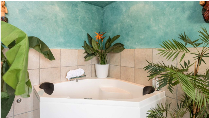
Hotel Zeit & Traum