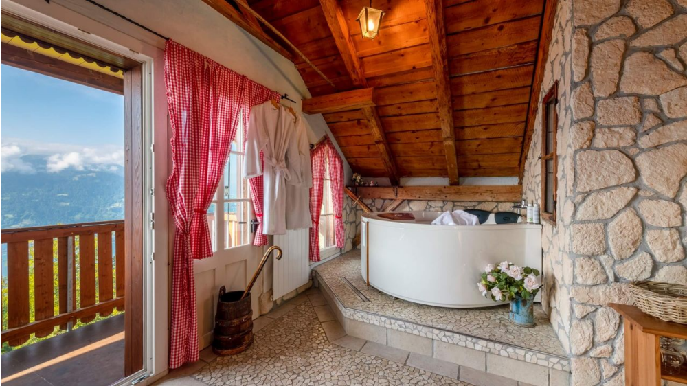
Hotel Zeit & Traum, Interlaken Tourismus - web@interlaketourismus.ch