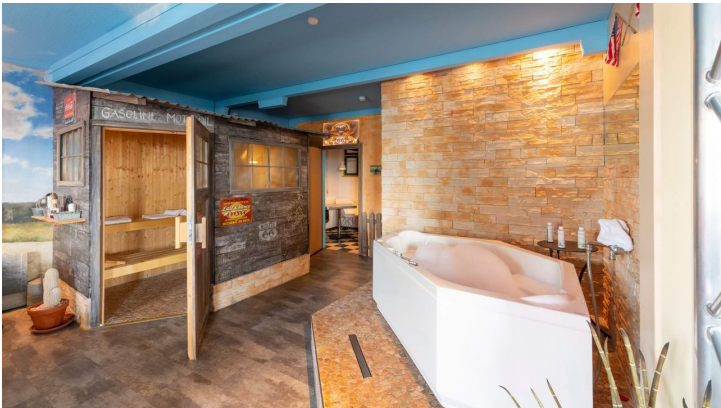
Hotel Zeit & Traum