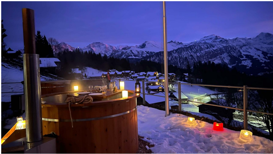
Hotel Beausite-Fassbind, Beatenberg