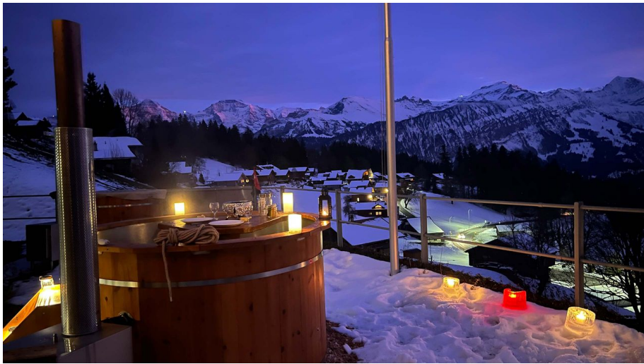
Hotel Beausite-Fassbind, Beatenberg, Interlaken Tourismus - web@interlaketourism.ch