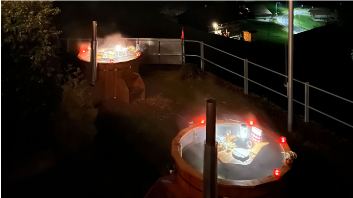
Hotel Beausite-Fassbind