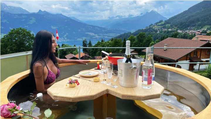
Hotel Beausite-Fassbind