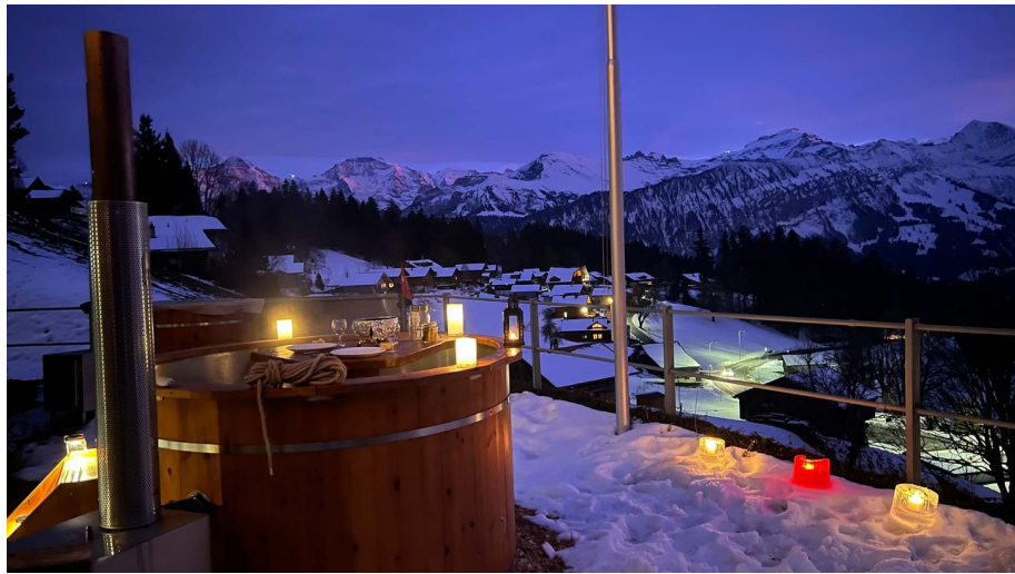
Hotel Beausite-Fassbind, Beatenberg