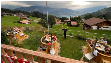
Hotel Beausite-Fassbind, Interlaken Tourismus - web@interlaketourism.ch