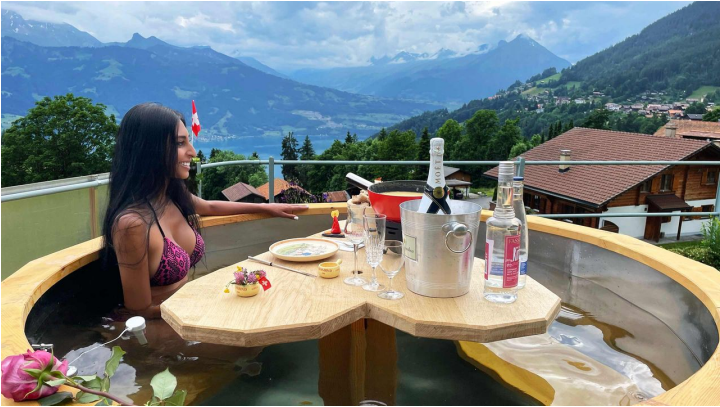
Hotel Beausite-Fassbind, Interlaken Tourismus - web@interlaketourism.ch