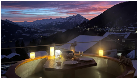
Hotel Beausite-Fassbind, Beatenberg