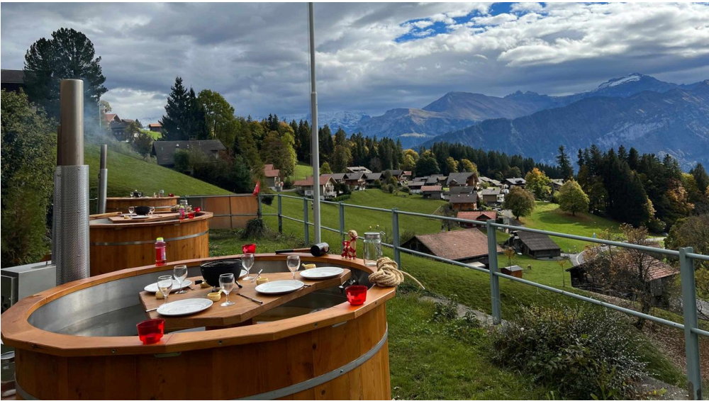
Hotel Beausite-Fassbind