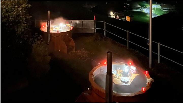
Hotel Beausite-Fassbind, Interlaken Tourismus - web@interlaketourism.ch