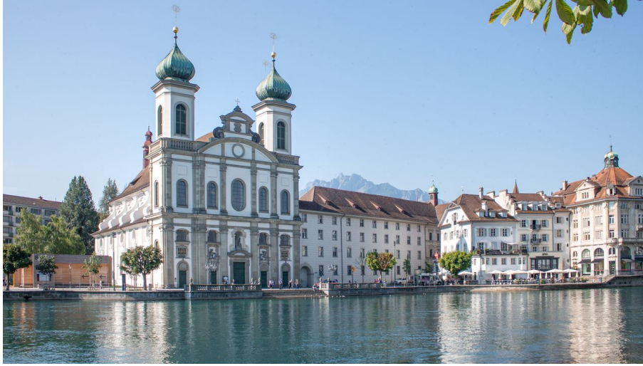
Jesuit Church in Summer