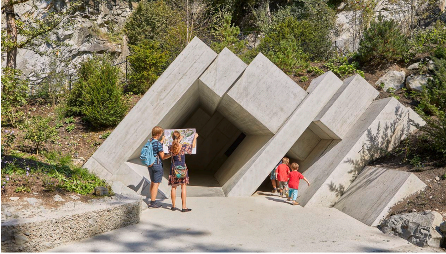
Glacier Garden