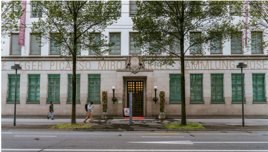
Rosengart Collection Front View