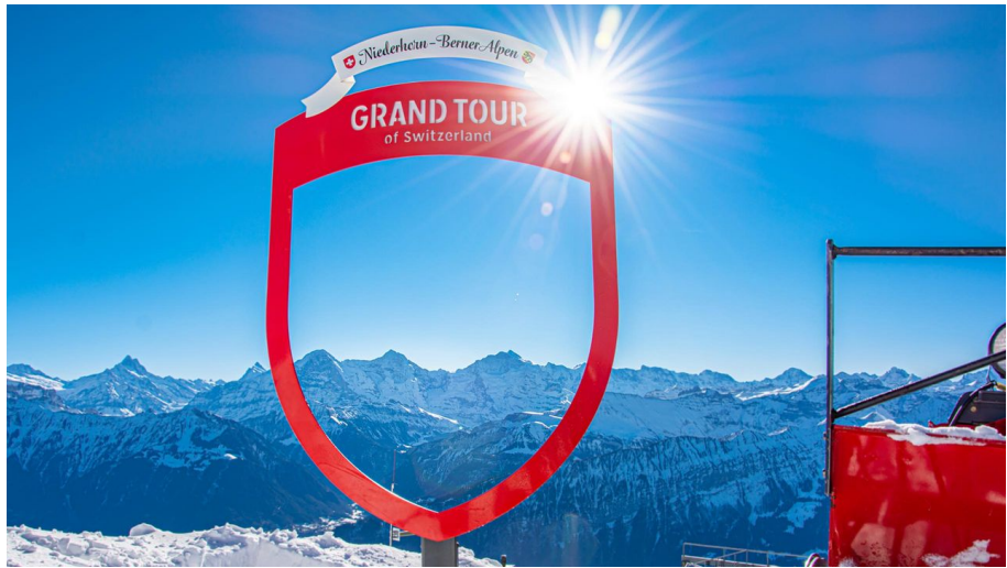
Niederhornbahn AG, Interlaken Tourismus - web@interlaketourismus.ch